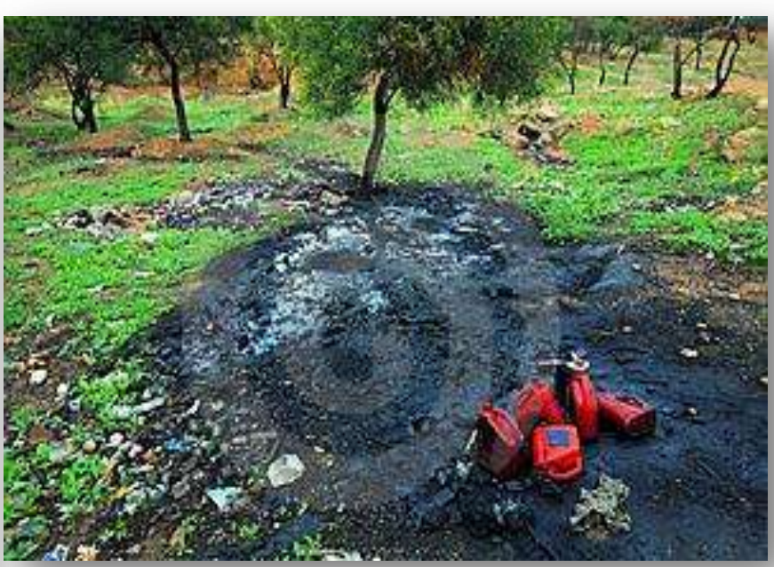
Soil pollution due to industrial waste