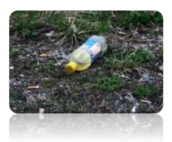
Excess use & disposal of Plastics and polyethene wastes